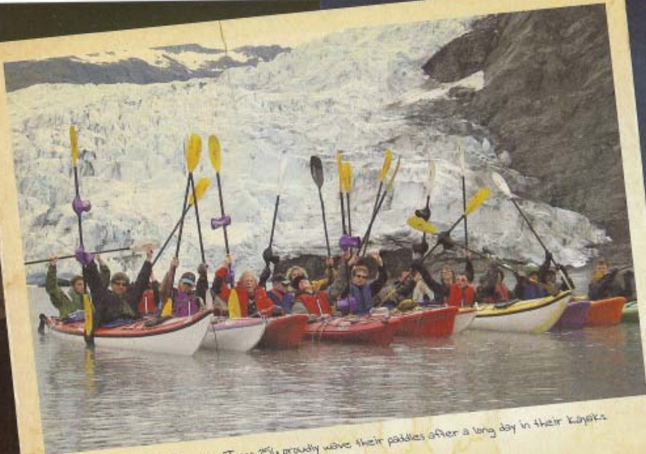
Scouts and adult leaders from Troop 256 proudly wave their paddles after a long day in their kayaks.